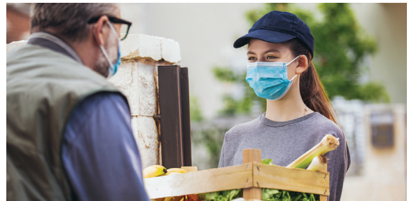
You are helping local residents endure the COVID-19 Pandemic. You are making a difference.

You might not have known it, but you have been very busy helping others since the Pandemic started. Thank you for your generosity.